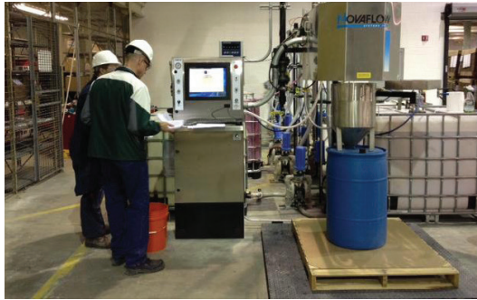
Nufarm controlled production at Alsip, Illinois, near Chicago. Custom blend equipment to deliver precise mixtures.